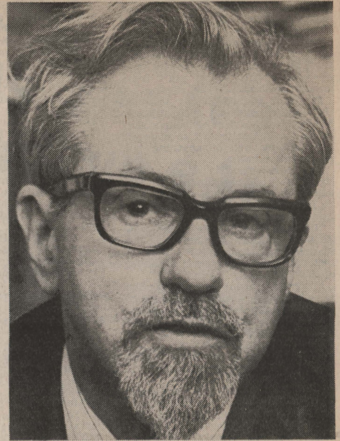
PROFESSOR HYNEK . . . air force expert

But even though the paradox-steeped pace is increasing, and blips are dripping from the radar screens, I doubt whether our sometimes merry, sometimes menacing companions are ready, yet, to announce their intentions.